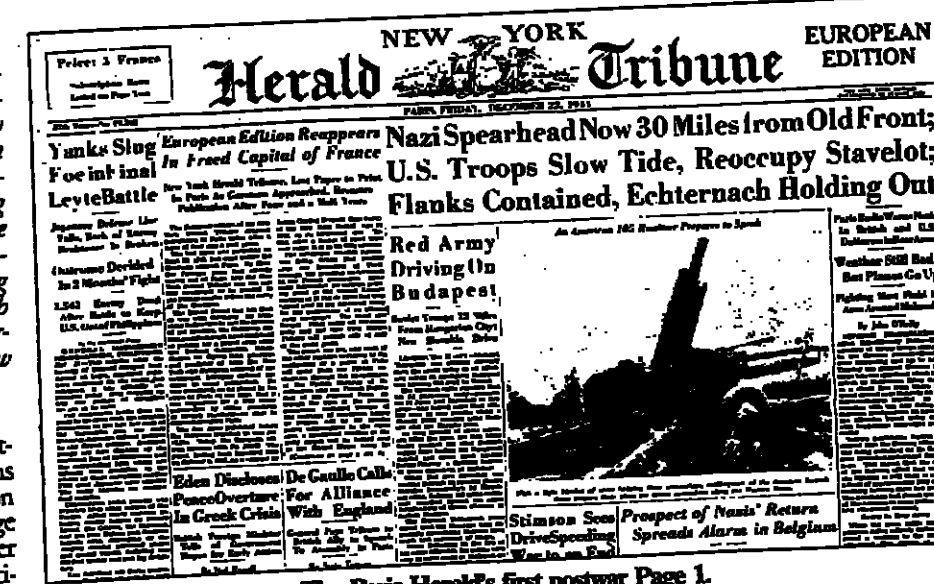
The Paris Herald's first postwar Page 1.

Champs Elysees, because the Stars and Stripes had taken over the premises to publish the army's own newspaper once the Germans fled. We shared our city room with young men in uniform, who worked on the other side of the partitioned city room.